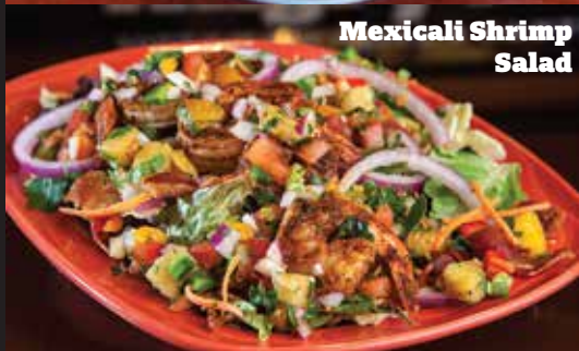
Mexicali Shrimp Salad