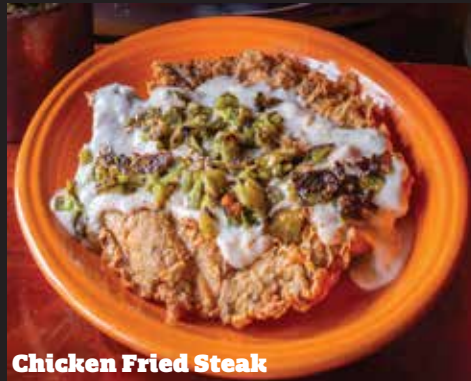
Chicken Fried Steak

Half rack of St Louis cut pork ribs broiled & basted in homemade Chipotle BBQ, Spicy Dr Pepper Sauce or Raspberry Chipotle served with beer battered fries & grilled corn on the cob.... 15