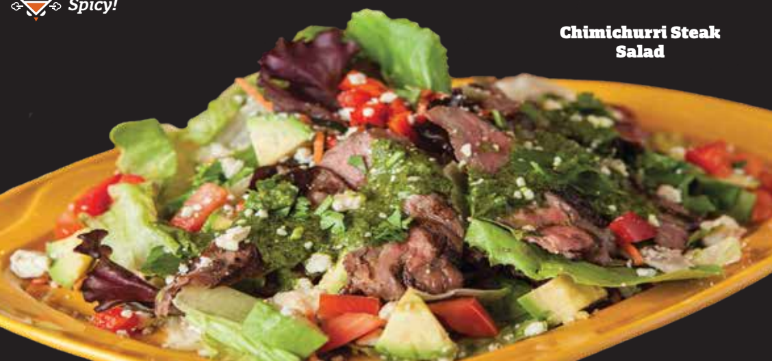
Chimichurri Steak Salad