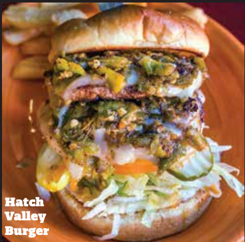
Hatch Valley Burger