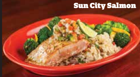
Sun City Salmon