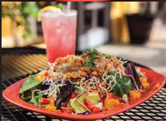
Sesame Ginger Chicken Salad