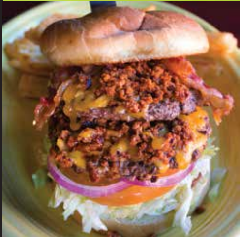
Chorizo, Cheddar & Bacon