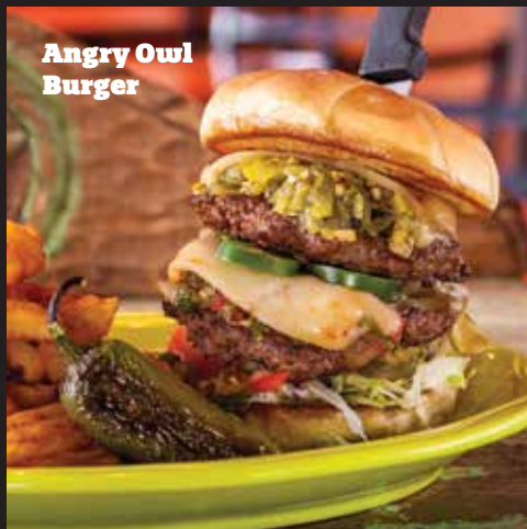
Angry Owl Burger