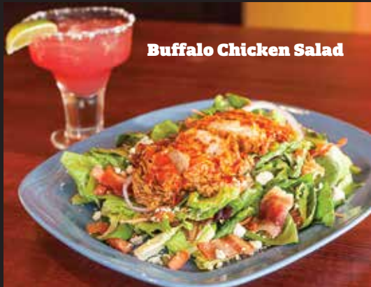
Buffalo Chicken Salad