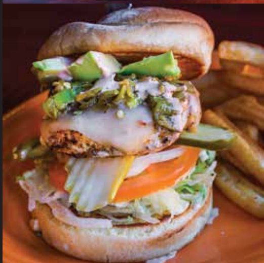
El Chuco Chicken