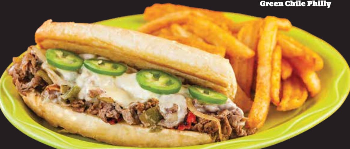
Green Chile Philly